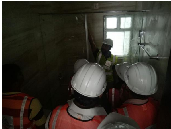
Installation process on 29 th June 2018

On the last day of workshop they conducted test and distributed the certificates.