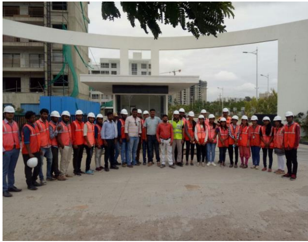
Visited Sai Ram Property 27 th june 2018