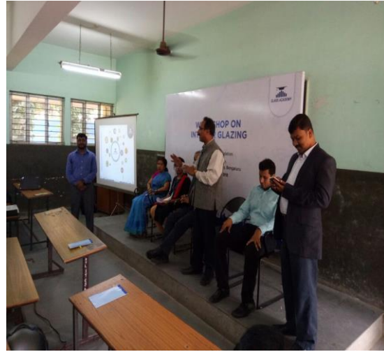
Principal addressing students on first day