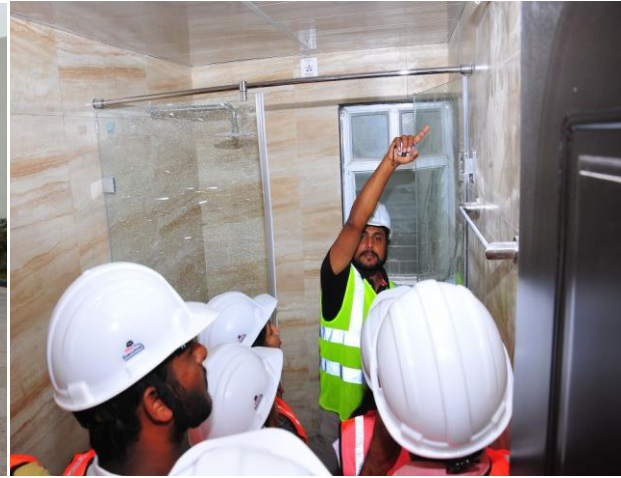
Teaching the types of shower enclosure

On the fourth day of workshop we visited “Nambiar builders, Bellezea”, students have learnt how to take the measurements and types of shower enclosure should be suggested.