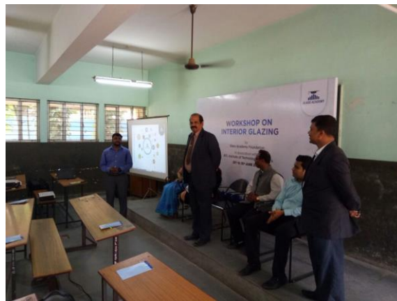
CEO addressing students

On the second day of workshop he has explained the types of glasses; add on features, types of shower enclosures, installation process, measurement and industry challenges.