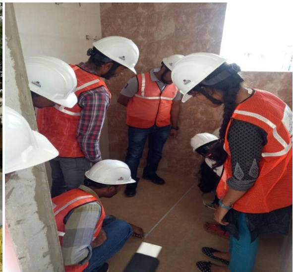
Taking measurements on 28 th june 2018

On the fifth day of workshop we visited same site and we learnt the installation process.